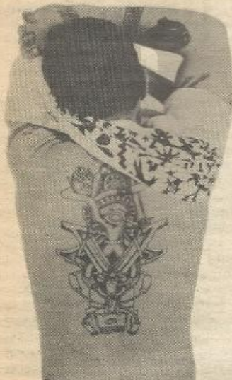
BY BRU DYE

"F AGGOT WISDOM: THERE IS more to be learned from wearing a dress for a day, than there is from wearing a suit for a lifetime."