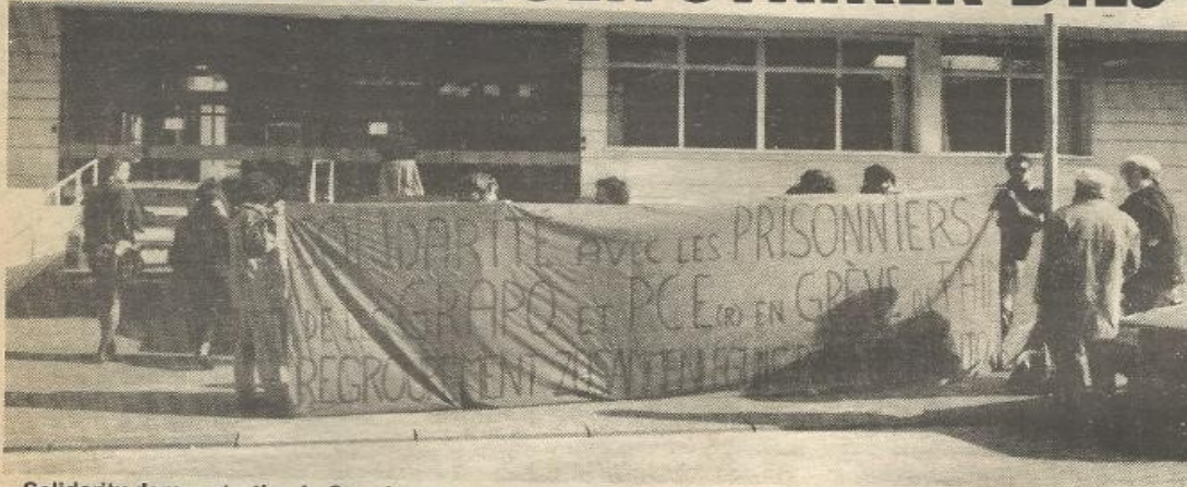
Solidarity demonstration in Strasbourg.