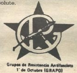
Grupos de Resistencia Antifascista 1° de Octubre (GRAPO)

The fight goes on, both for prisoner respect and Basque autonomy. At present, 3 hunger strikers are being kept artificially alive on machines. But the 39 GRAPO hunger strikers remain resolute.